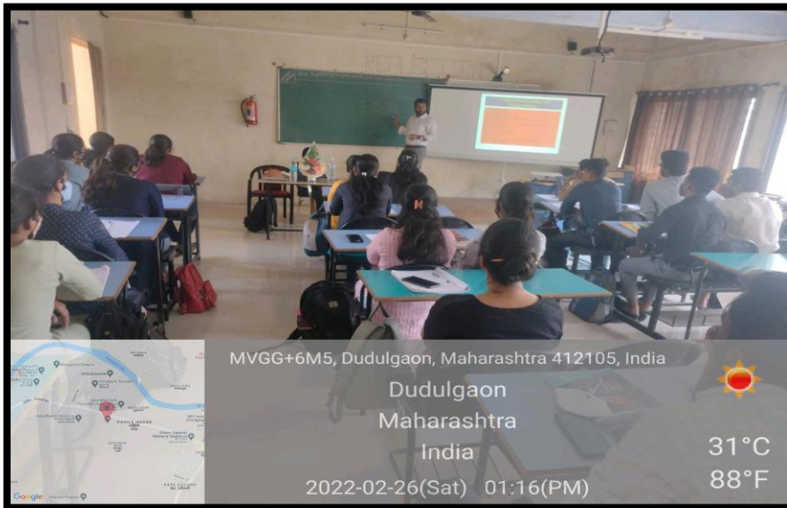
Class Room Projector