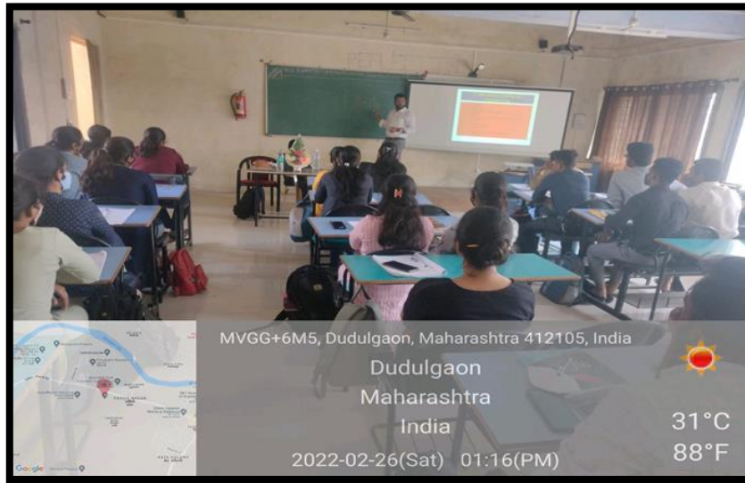
Class Room - I