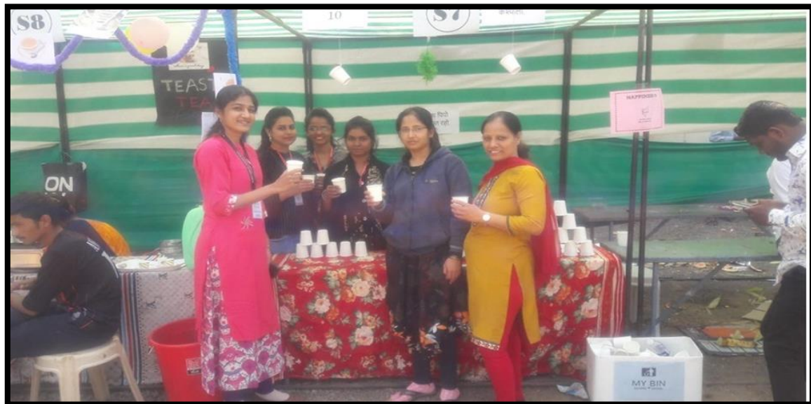
Funfair For Students