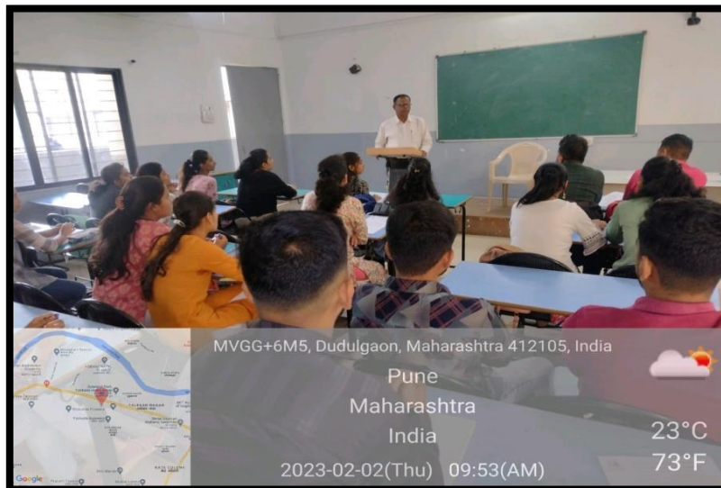
Class Room - II