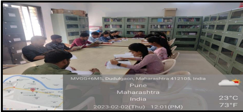
Students in Library