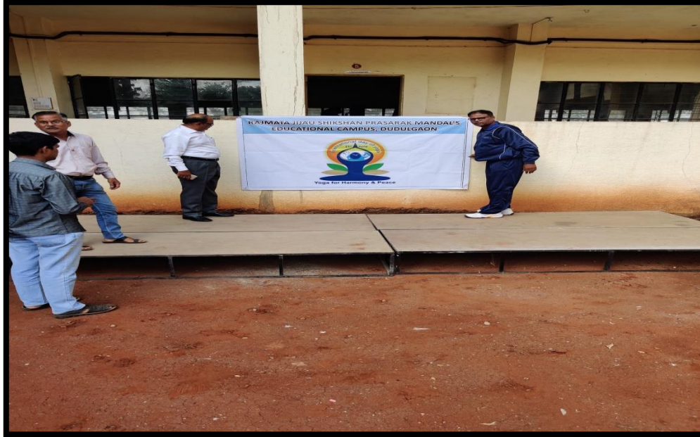
Yoga Day celebration