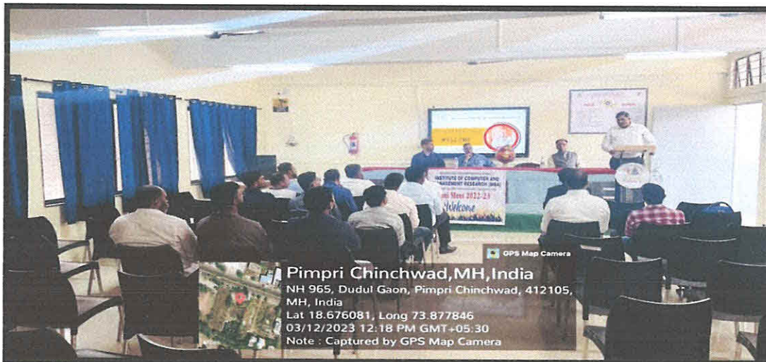
Welcomed By Director