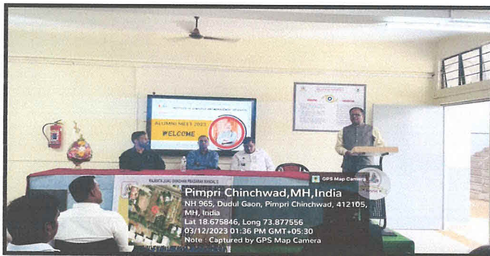
Faculty interacted With Alumni's