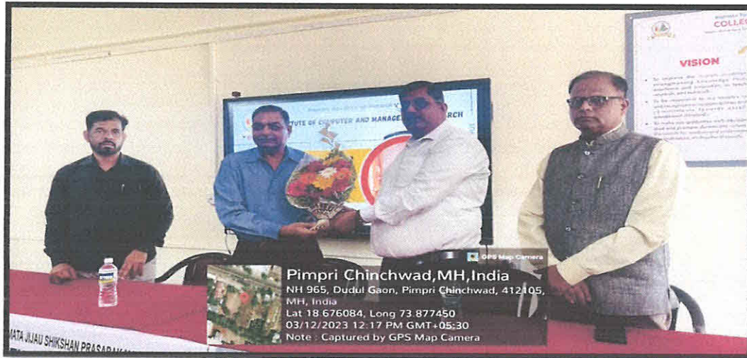
Felicitation of Chief Guest