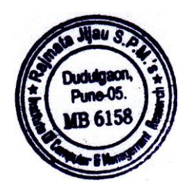
DIRECTOR RAJMATA JIJAU SHIKSHAN PRASARAK MANDAL'S INSTITUTE OF COMPUTER & MANAGEMENT RESEARCH